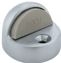
FS438 Meets ANSI/BHMA 156.16, L12141 for brass or bronze and L32141 for aluminum.