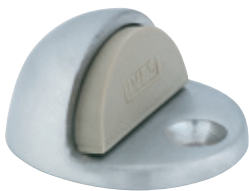
FS436 Meets ANSI/BHMA 156.16, L12141 for brass or bronze and L32141 for aluminum.