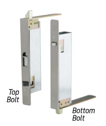
Meets ANSI A156.3 Type 27. UL Listed 90 Minute Fire Doors 8'0" x 8'0"