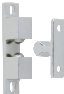
Meets ANSI/BHMA 156.9, B13302.