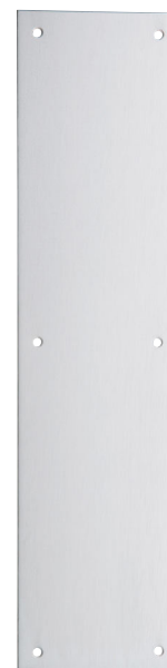
For plates up to 4"