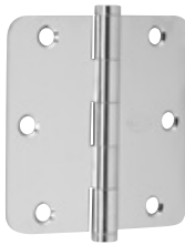
1012 Schlage Carded Only