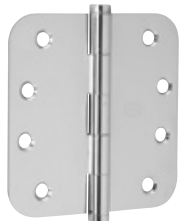
1020 Schlage Carded Only